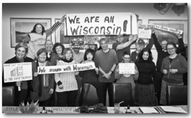
Supporting labor union rights in Wisconsin, March 3, 2011