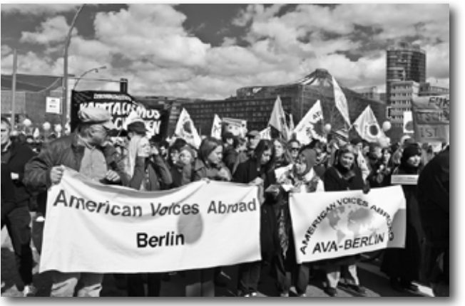
Anti-nuclear protest after Fukushima tsunami, March 26, 2011

• Come to our Stammtisch the first Thursday of each month at 8 pm. Check www.avaberlin.org for current location. Good food and conversation, and occasionally guest speakers.