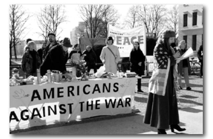
Pariser Platz Filibuster, March 15, 2003