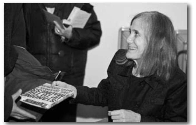
Amy Goodman lectures in Berlin December 12, 2008