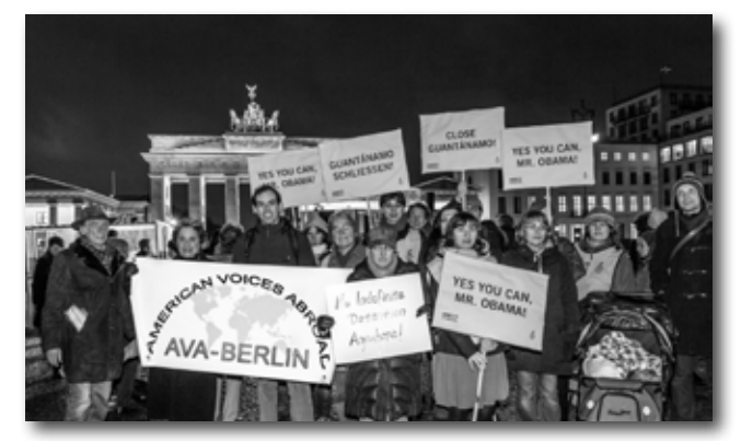
Joining Amnesty International to protest the prison at Guantánamo. January 11, 2012 and June 19, 2013 (above)