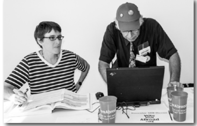
Voter Registration with Democrats Abroad Berlin, July 5, 2008