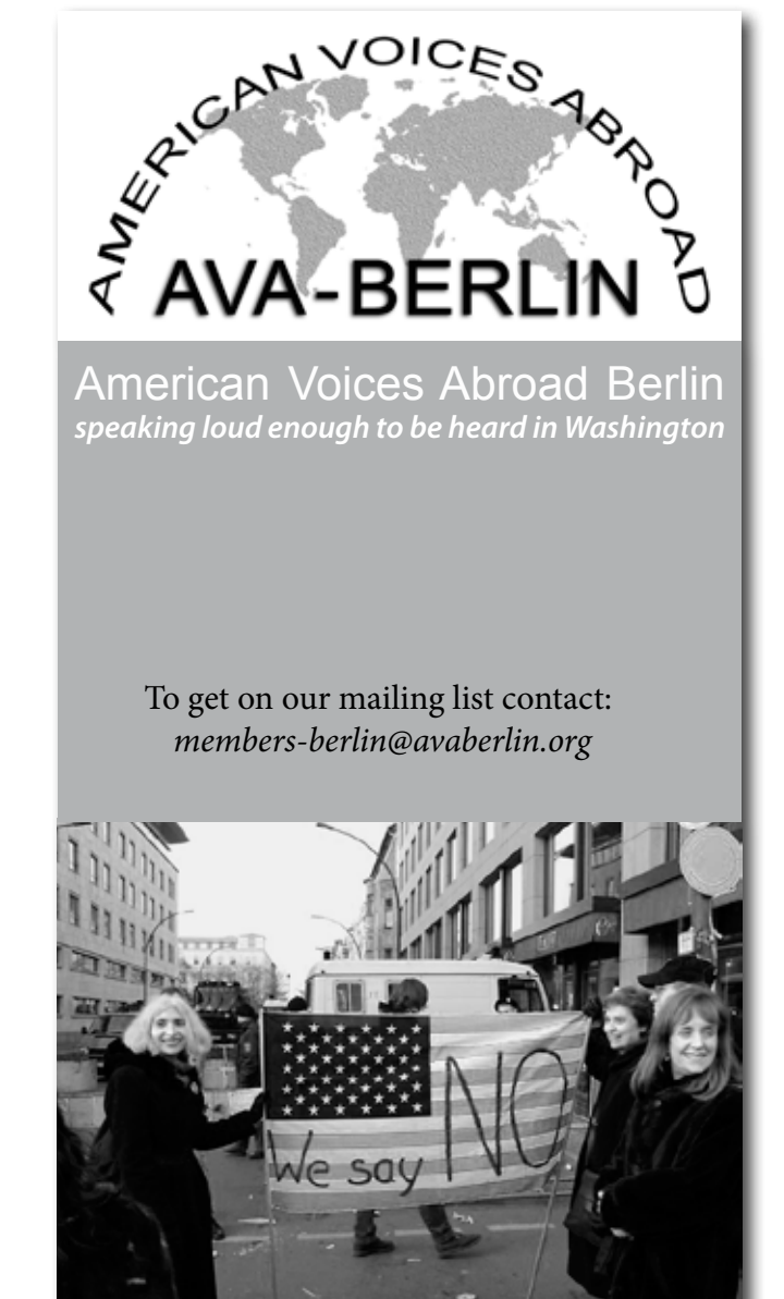
Protesting the Iraq War by the US Embassy, Berlin, Mar. 20, 2003

For more information on AVA–Berlin www.avaberlin.org www.facebook.com/AmericanVoicesAbroadBerlin